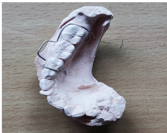
FIG. 4 Completed guiding flange prosthesis. Note arrows indicating the buccal indentation of opposing maxillary teeth