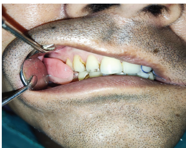
FIG. 6 Final prosthesis: intraoral view. Note the correction of the deviation.

The inclination of the acrylic ramp was adjusted by selectively trimming the teeth contacting surface or adding the autopolymerizing acrylic resin (DPI cold cure) on chairside. Thus acrylic ramp was developed intraorally to guide the mandible in definite position. Care was taken to preserve the buccal surface indentation of opposing maxillary teeth which were guiding the mandible in a final definitive closing point during mastication (Fig- 4). The flange height was adjusted in such a way that it guided the mandible from large opening position (in practical limits of the height of the buccal vestibule) to maximum intercuspation in a smooth and unhindered path (Fig-5).