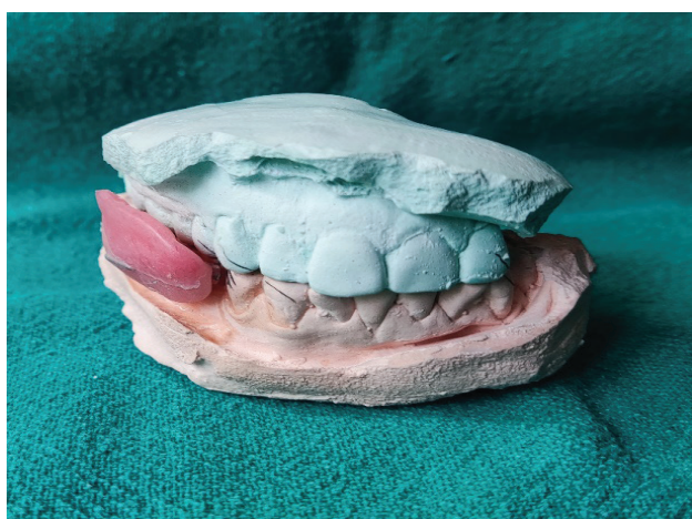
FIG. 5: Buccal extension of acrylic guidance ramp.