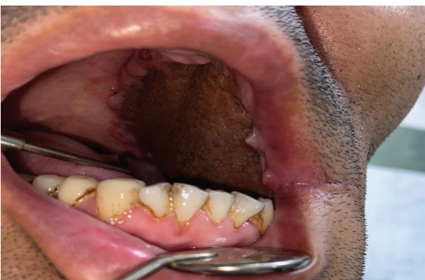
FIG. 2: Intral oral view showing free flap. Note the deviation of mandible to defect (left) side on opening

An orthopantomogram revealed resection of the maxilla distal to left canine and resection of mandible distal to left second premolar